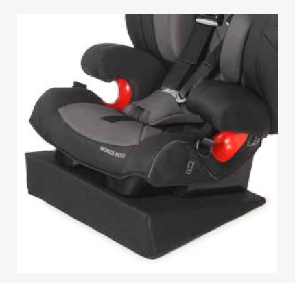
The seat wedge inside and below provide a relaxed resting position during the journey. The abduction block offers extra positioning for children whose legs cross or "scissor".