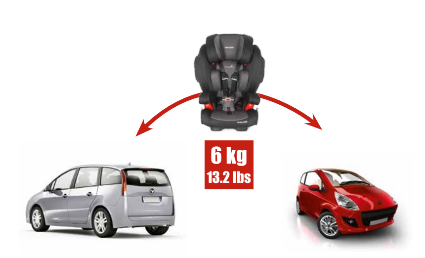
Quick and easy seat transfer from one vehicle to another.

Lightweight booster seat exceeds highest safety standard