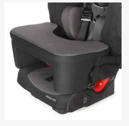
The table is a support surface and an additional impact shield that also prevents the child from attempting to unbuckle the 5-point positioning harness.