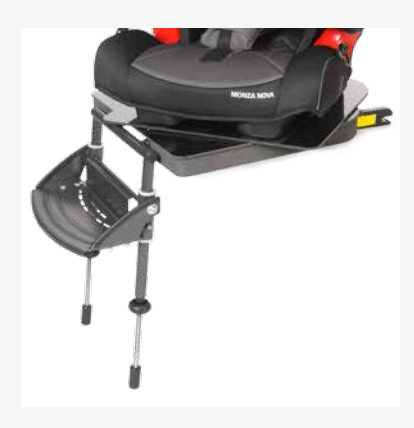
The practical padded swivel base, the Seatfix connection for ISOFIX and the footrest give additional stability.